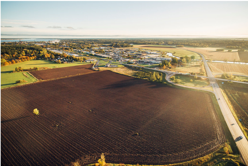
Figure 2. An example of the images presented by Mariestad Municipality to illustrate the potential for external investment (Illustration: Mariestad Municipality, (Mariestad, 2017)).

One example of how the municipality is working actively with industrial renewal and to attract external investment is the process around the establishment of a new battery cell factory in Europe in 2017. In March 2017, the company Northvolt announced a competition and 'site selection process' for a new facility. Mariestad and nearby Skövde municipality (55 000 inhabitants) joined forces to present a common application in which they highlighted the sub-regional scale of Skaraborg to fulfil the technical and qualitative demands. The regional mosaic of towns and countryside was used to answer to requirements such as the distribution of (clean) energy and access to clean water, technical partnerships (recycling and sustainable processes), and customer and supply perspectives with, for example, the car and mining industries (Business Region Skaraborg, 2021). The agricultural landscape was used to illustrate the availability of sufficient land to