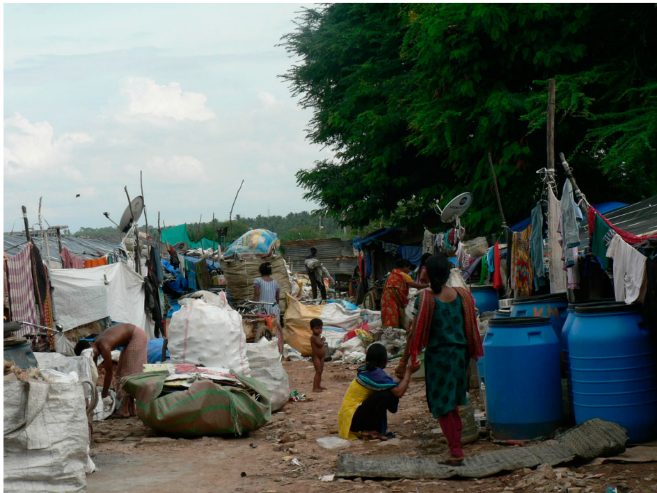
Figure 3. A Glimpse inside the Marathahalli Settlement.

PAR model. The current issues of most concern faced by a community are represented by the trunk of the tree which aligns with the dynamic pressures in the PAR model. Factors that influence these main issues are depicted by the roots of the tree which is similar to the root causes and the outcomes are represented by the leaves which depict unsafe conditions in PAR model (ODI, 2009).