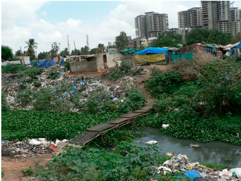
Figure 2. Picture depicting the location of Hebbal Settlement alongside an open drain.

developed by (Blaikie et al., 2014) provided an ideal analytical template to examine the causality of vulnerability from a structural perspective. All variables analysed in the study (outlined in Figure 1) emerged from interactions with the community members including semi-structured interviews and focus group discussions. A problem tree 3 (see Figure 1) is used as an allegory to represent the findings from the study using the