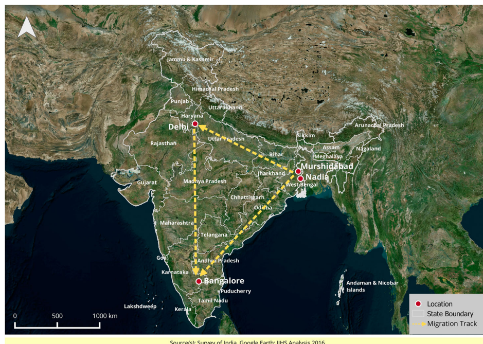
Figure 4. The map depicts the migration path of the waste pickers.

At the national level, the new economic policies post-1991 have exacerbated inequalities between various socio-economic classes in India with purchasing power concentrating among the elites and the middle classes (Patnaik, 2009; Vakulabharanam, 2010). This period in India has also been marked by sectoral imbalances with the performance of the agricultural sector raising severe food security concerns (Balakrishnan, 2017). With a country highly dependent on climate-sensitive sectors like agriculture, climate adaptation is a priority area which