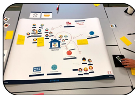
d: Actor, service, activity cards