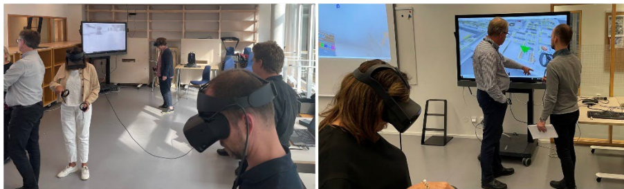
Figure 1. The set-up during the first workshop (left). Different participants viewing and discussing potential design issue areas during the second workshop (right).

During these two workshops, at least one person from the research team was available for supervision and providing help in terms of showcasing how to navigate via the provided VR-hardware. The VR system that was used were three Oculus Rift S kits, together with the software BIMXplorer. The software supported direct import of IFC-files from the design process, without any need for further optimization. Additionally, there were functions such as a measuring tool, taking screenshots, markups, and support for multi-user collaboration. During the VR-workshops, the participants used mentioned hardware kits coupled with a big screen display and two laptop displays, see Fig 1.