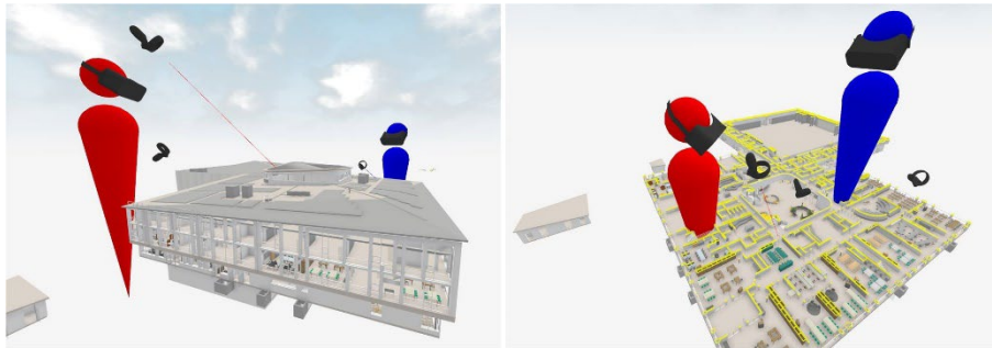
Figure 2. Miniature model showcasing the building in its entirety as well as sectioning of the various floors reviewed by the participants.

The result was analysed within the theoretical framework of egocentric and allocentric design space representation. This was done to discover patterns in terms of the design issues discovered and discussed among the participants during the workshops as well as to gain a better understanding for how a combination of these two design space representations help facilitate spatial understanding among the participants.