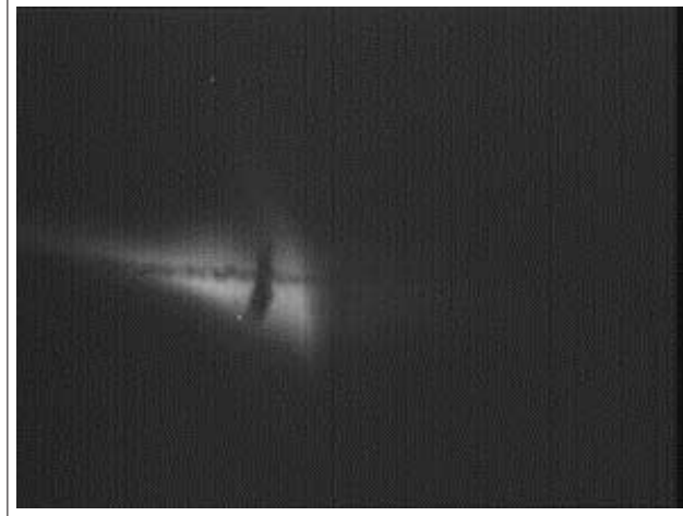
Fig. 2. – ^{12}\text{C} calibration beam profile, captured by the beam camera posed at the entrance of SEC.

onto a two-stages silicon telescope ( \Delta E and E were point-like detectors of 15 and 700 \mu\text{m} , respectively), who has turned to be crucial to verify the RIB purity, as it can be seen in fig. 3, where the only ^8\text{B} locus is visible.