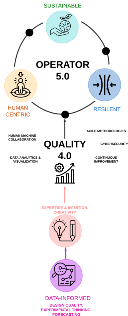
Fig. 2. Data-Informed Quality 4.0 input to Operator 5.0

proficiency in advanced technologies such as AI, automation, and machine learning, as well as strong problem-solving abilities, adaptability, communication skills, and a willingness to learn and embrace new technologies. It is also important to focus strongly on customer experience, operational efficiency, and continuous improvement.