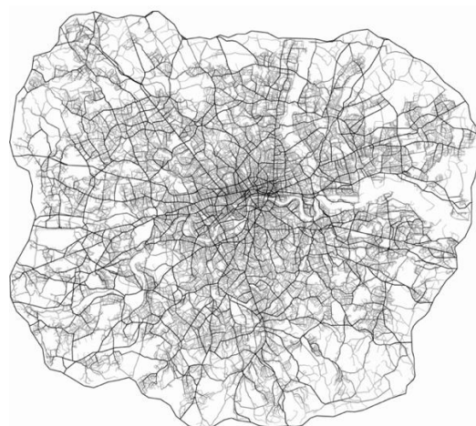
Figure 3. The foreground network (dark grey), according to Hillier, facilitating socio-economic exchange and renewal through high accessibility, and the background network (light grey), facilitating socio-cultural continuity and reproduction through low accessibility. The pattern is produced by measuring the betweenness centrality for all street segments in the complete street system.

“The foreground structure, the network of linked centres, has emerged to maximise grid-induced movement, driven by micro-economic activity. Micro-economic activity takes a universal spatial form and this type of foreground pattern is a near-universal in self-organised cities. The residential background network is configured to restrain and structure movement in the image of a particular culture, and so tends to be culturally idiosyncratic, often expressed through a different geometry which makes the city as a whole look spatially different” [63] (p. 150).