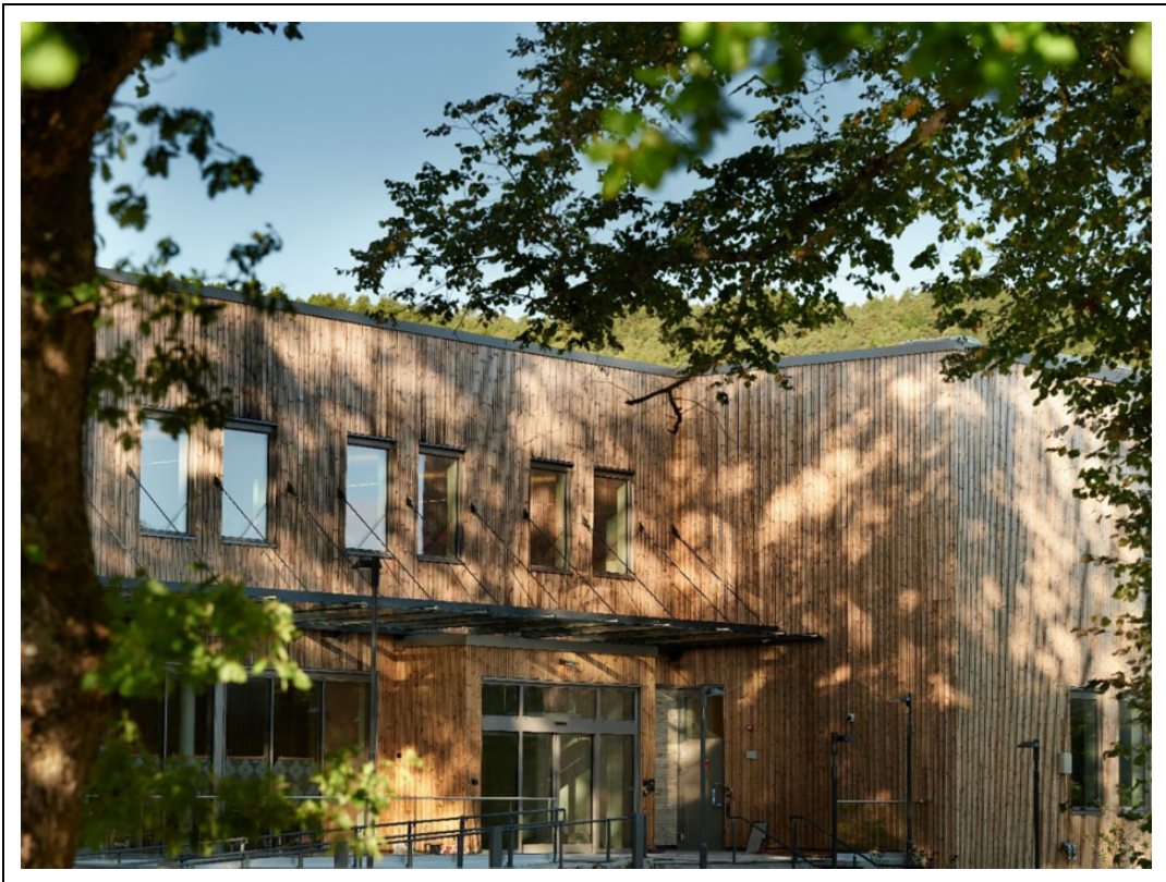
Figure 1. Main entrance.

before the interviews took place to inform the participants about the study and answer questions that they might have and to provide information about informed consent, the reasons for conducting the research, and that it was possible to withdraw at any time without supplying a reason for withdrawal. Nine participants agreed to participate, and five declined, did not reply, or could not participate during the period in which the interviews were collected. None of the participants withdrew from the study after agreeing to participate and providing informed consent.