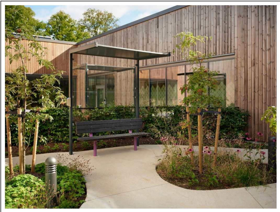
Figure 2. Inner courtyard.

colleagues, as they wanted to participate together or not at all. Eight interviews were conducted in person/physically, and one interview was conducted via Zoom. The length of the interviews ranged from 27 to 64 min. The average interview time was 44 min, and they were audio-recorded and transcribed verbatim by the interviewer. Most of the interviews took place at The Outdoor Care Retreat (a wooden cabin located at the hospital premises), as it was considered to supply a natural frame being located in nature with natural materials, rich exposure to daylight with big windows, and a view of nature. However, not all participants wanted to travel to The Outdoor Care Retreat for practical reasons and due to a shortage of time. Five interviews took place in The Outdoor Care Retreat, three in the participants' office, and, as previously mentioned, one interview was digital on Zoom. Only the interviewer and the participant were present.