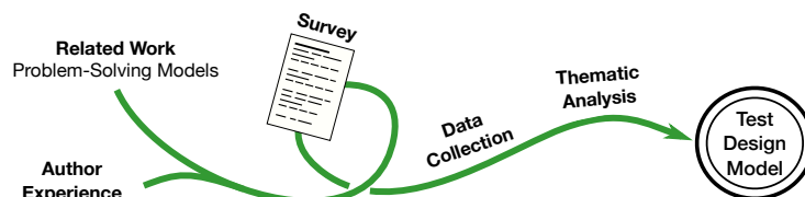
Fig. 1. Overview of the method used for collecting data and developing the problem-solving model of test design.

with a theory of the mental images and processes that produced them. The questions were defined as procedures that evaluate the coherence and accuracy of a person’s developing mental model, while the hypotheses were identified as a planning process that draws on various forms of knowledge.