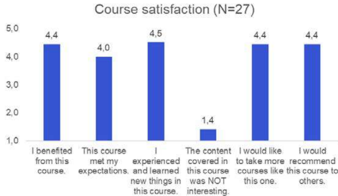
Figure 1: Mean values of agreement with statements regarding course satisfaction (1...strongly disagree 5...strongly agree).

The thematic analysis of the participants answers to the open questions about what they liked and disliked about the course is presented in Tab. 3. Among the positive aspects of the course, the active learning activities and other course materials were particularly often mentioned, as evidenced through comments like: