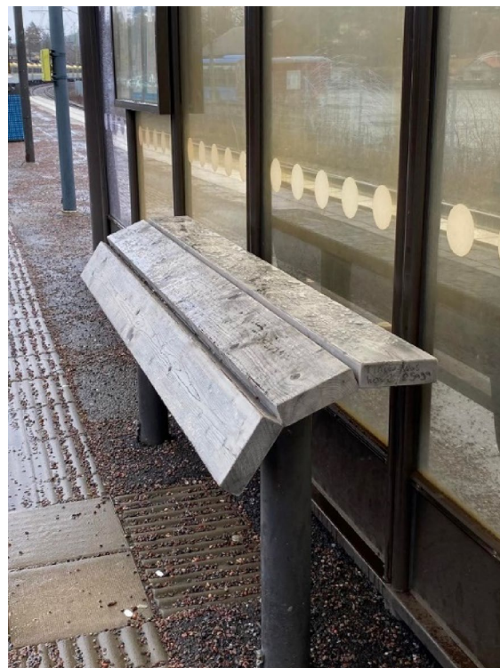
Picture 6 Stand-up bench, Norsesund, Sweden