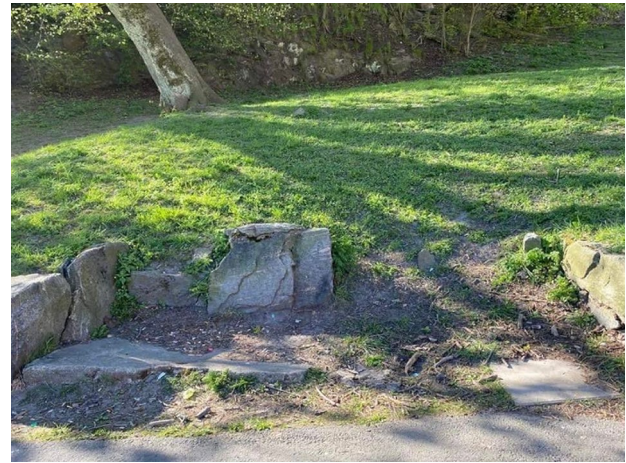
Picture 1 A former bench at a playground in Gothenburg, Sweden, where people used to sit, drink alcohol, and use drugs

There are few thoroughly developed definitions of “defensive design” in the debate. However, some definitions capture the phenomena to some extent, and these are of great use when developing a comprehensive account. One of the most cited definitions of hostile design is the following: