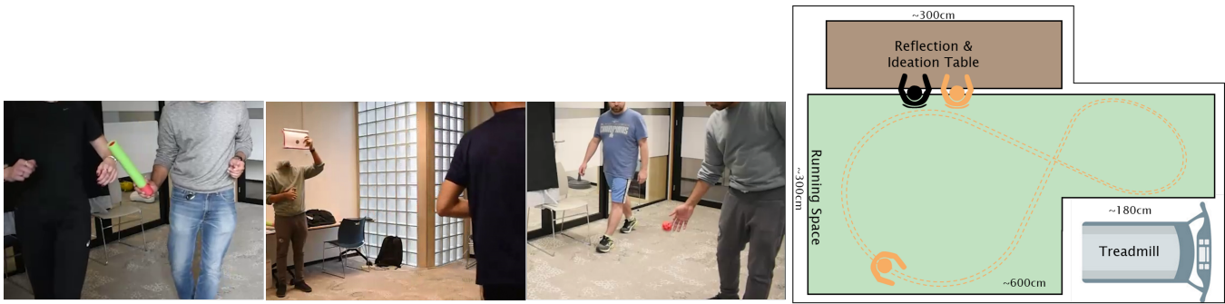
Figure 2: Left to Right: Examples of how feedback was presented to runners (Haptic, Paper Visual, Bouncing Ball Visual) and Layout of the Study Setup

drone’s capabilities. This included a demonstration using video from a DJI Mavic Pro to estimate lower body angles and present real-time feedback (workflow of the demo presented to the participants is included in supplementary material, Figure 4), as well as examples of how drones could present feedback through various modalities (Figure 5 in supplementary material). These examples included audio (speakers [61], and noise [6]), visuals (lights [22], screens [22, 25, 66], projectors [7, 13, 36, 53], and movements [15, 20]), and haptics (drone tactile [36, 57, 68], and sleeves [24, 62]). Participants’ likability of drones was assessed before and after the presentation of information about the drone’s capabilities using the Godspeed questionnaire [10]. The aim of this step was two-fold. First, to understand whether the participants’ likability of drones changed positively after receiving more information, indicating the new information allowed them to see the drone as capable of supporting them during the run. Second, to understand participants’ preferences, regarding how they would like drones to present feedback on their preferred running parameters, grounded in their reflections and realistic possibilities of how drones could present the feedback. The study was designed with the safety and health of the participants in mind and was reviewed by our university’s ethics board.