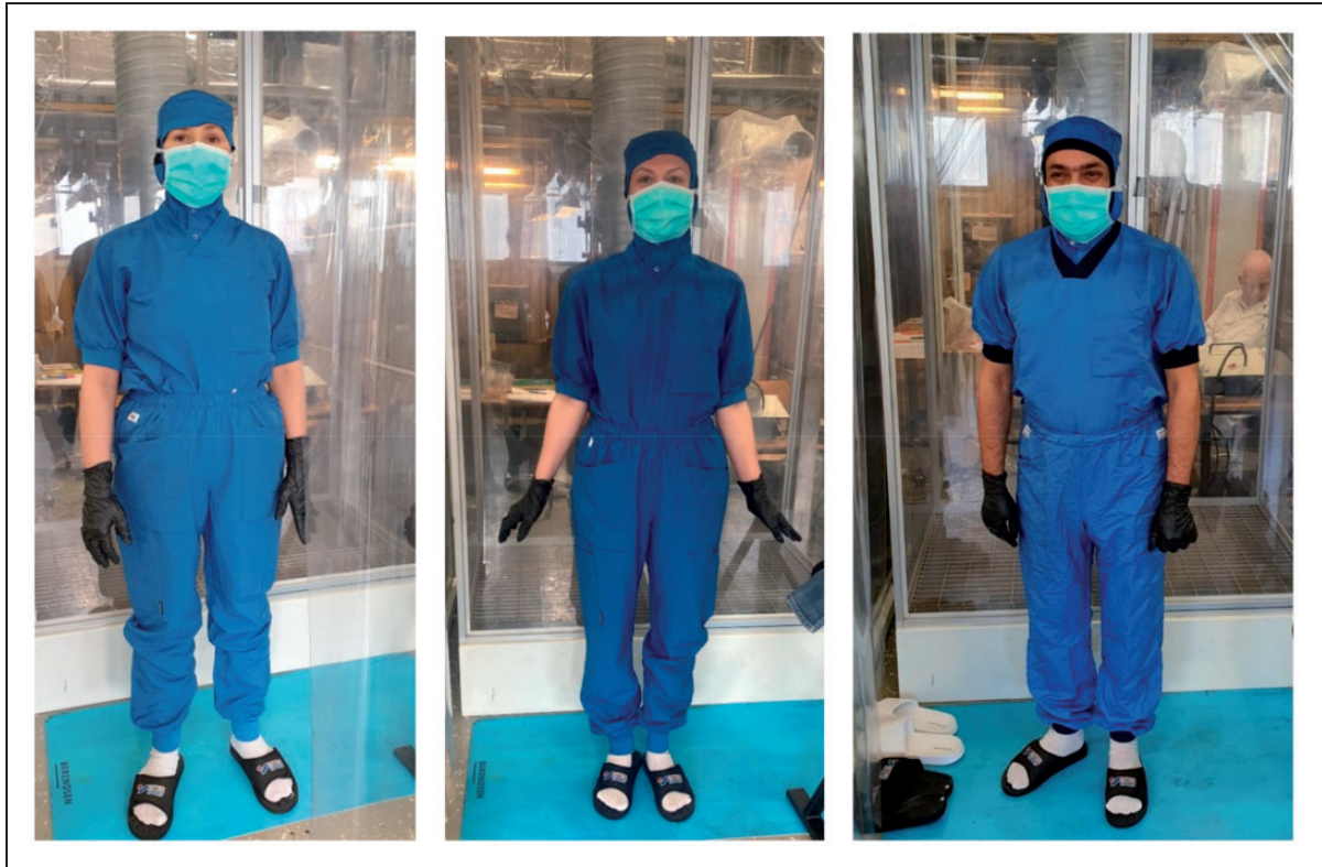
Figure 1. Clean air suits tested. From left to right: A, B and C.