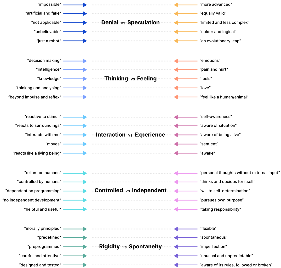
Figure 4: The five dynamic tensions are shown in their opposing categories. Key underlying concepts from the participant data characterise each category e.g. Denial summarises concepts such as “impossible”, “artificial and fake”, “not applicable”, “unbelievable”, and “just a robot”.

On the other side, some comatose patients and patients with ‘locked-in’ syndrome have subjective experience despite being unable to interact with the outside world [106]. These patients’ brain activity can be comparable to that of non-patients [107], yet they cannot physically respond to external stimuli. An analogous technological example could be a ‘conscious’ computer or GPU, that does not have the ability to display output on a screen; it may have experience but cannot express it. Hence, while the traits of experience and interactivity initially appear to be intrinsically linked, a more complex dynamic relationship hides between the two.