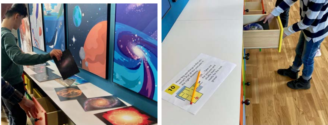
Figure 2: The Onsala Space Observatory visitor center exhibition (left) and a user interacting with the How Big Are Things In The Universe installation (right).

The second part of the study was conducted at the newly-opened visitor centre at a research facility, Onsala Space Observatory (Fig. 2). Here also we applied design methodology, this time putting the learnings gained at Universeum into practice when creating quests to increase interaction for the new environment. Here, we tested quest-driven activity cards with school classes on arrival at the observatory's visitor centre during a guided tour. Here we also wanted to explore Karléns third exhibit type, Social interaction emerging from collaboration. We created a set of 25 activity descriptions which we tested in a series of five half-hour sessions with classes of different ages (from 8 up to 17), modifying the tasks and design between sessions. We also tested the tasks at a public event with participation from adults and children in 3 half-hour sessions, and with two groups of senior citizens.