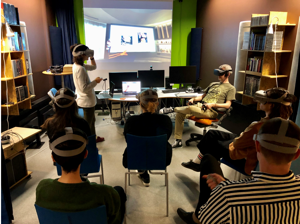
Figure 2: Photo of the lecture in Kuggen Medialab.

interfaces. All of this in analogy with a teacher in architecture that would hold a lecture about lecture halls in a lecture hall.