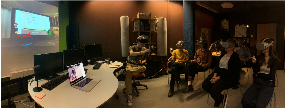
Figure 1: Lecture in Virtual Reality

this technology now? What factors can be considered to make the experience positive to both educators and students?