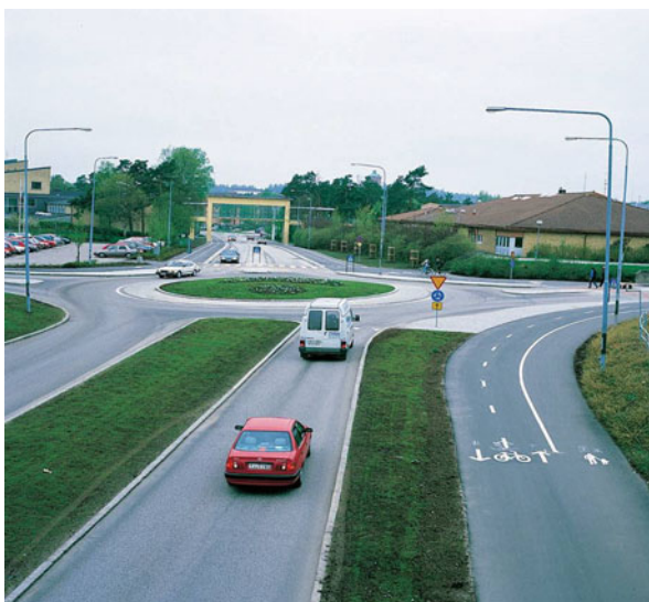
Illustrations about 2+1 roads and roundabouts (Swedish Transport Administration 2019)

The safety core of Vision Zero is very much to design for the failing, non-perfect human – the human making misjudgments, errors, and mistakes. This is in strong contrast with the idea of perfect humans in traffic. The National Highway Traffic Safety Administration (NHTSA) in the USA finds that 94% of accidents are because of human error. This illustrates that the road traffic system is not designed for humans with the capabilities and weaknesses they have. The 94% human error problem, as described by NHTSA, can lead to the conclusion that we must develop driver further. In Vision Zero, the main focus is to develop the road transport system to absorb human failures to avoid fatalities and serious injury. However, we must bear in mind that humans are relatively good at driving.