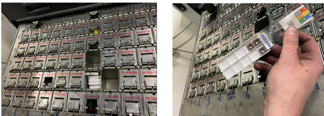
Fig. 2. The ERP-supported tooling poka-yoke control.

IoT and connection level technologies supported standardization with transparent production data. It could be achieved by using