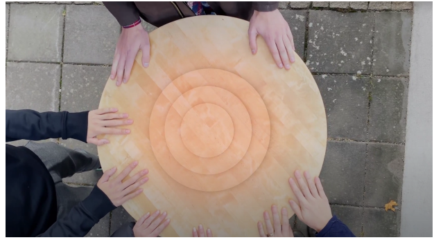
Figure 3: A screenshot of the video prototype using a digital overlay to visually communicate the tabletop heating feature.

This section will reflect on the prototyping techniques explored in the making of the expressive robotic table; in particular, reflecting on each technique with its benefits and drawbacks which can support our future development in this project. A summary of the pros and cons for each of the techniques used is shown in Table 1.