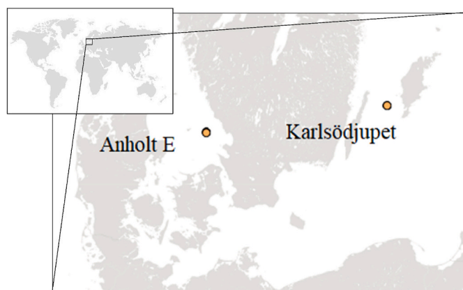
Fig. 1. The geographical location of the sampling stations Anholt E (in Kattegat – saline water) and Karlsödjupet (in the Baltic Sea – brackish water).

for Mn, Zn and I at respective masses 55, 66 and 127 were taken five times to generate average value and standard deviation.