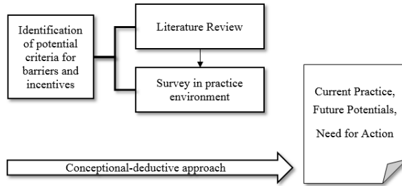
Fig. 1. Research approach