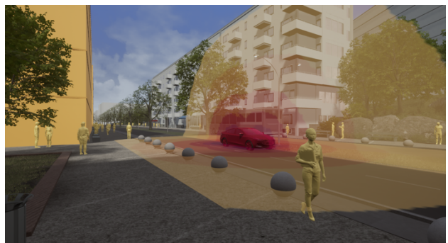
Figure 3. Visualization of noise in the project with a colour scale ranging from lighter yellow to darker red, where red symbolizes the strongest noise area and yellow the weakest.

Updating of the prototype was made with input from the workshops. Participants confirmed that it was difficult to interpret the rainbow scale, both in 2D and 3D. The best working colour scale in a 3D visualization according to the participants, which we ultimately chose to use in the project, is shown in Figure 3.