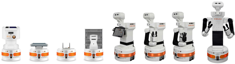
Fig. 1 An excerpt of the TIAGo robot family

people after a disaster), and the environmental conditions (e.g., indoor, outdoor, underground). For instance, the robot TIAGo 5 —one of our target robots—is available in many different variants, some of which are illustrated in Fig. 1. Not only the different hardware and mechanical structure but also the missions that TIAGo performs require appropriate mechanisms to deal with variability.