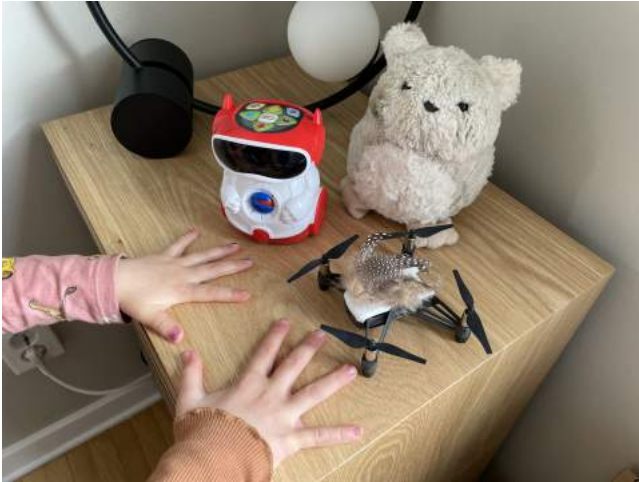
Figure 2: An image of the three indoor robots: DOC, the humanoid robot; TELLO with feathers (the drone); and PURBLE, the stuffed animal robot. ELSA’s and ANNA’s hands can be seen for scale.

[17]. To inform the design, I have been conducting a year-long longitudinal study at home, with my own children (aged 6 and 3) and four commercially available robots, one of them being a drone. While the focus of this paper is drones, the combination of different robots aimed at supporting a variety of perspectives, and finding potential common or divergent characteristics between flying robots and other types of domestic robots. The study contributes with a description of experienced qualities of flying robots in a natural domestic setting.