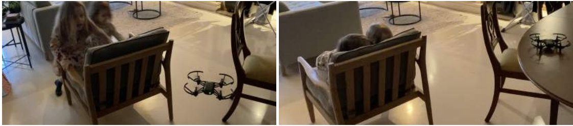
Figure 8: The children hide from the drone behind furniture.

Touch: The children created intricate touch interactions with the drone, which were not limited to carrying it. The propellers are easy to fiddle with when the drone is inactive. However, its cold surface never led to a closer contact with any other body part. Even when decorated with feathers (which the children did touch and play with), no further closeness was exhibited. The most exciting of activities were connected with the drone landing or taking off on body parts, such as on the hand. Although the ability to touch does not seem to have any relationship to the children's perception of autonomy, it still promoted a clearer path to ownership. Carefully manipulating the materiality of the drone is a relevant endeavour to consider.