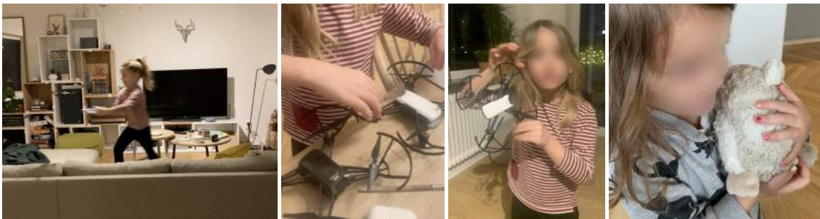
Figure 7: Four images showing (left) ELSA chasing the drone to help it land by climbing on furniture, (middle-left) ELSA fiddling with the drone propellers, (middle-right) ELSA with the drone stuck to her hair and (right) ANNA holding PURRBLE close to her face.