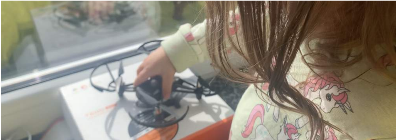
Figure 1: The DJI Tello Drone, picked up by the small hands of a three year old.