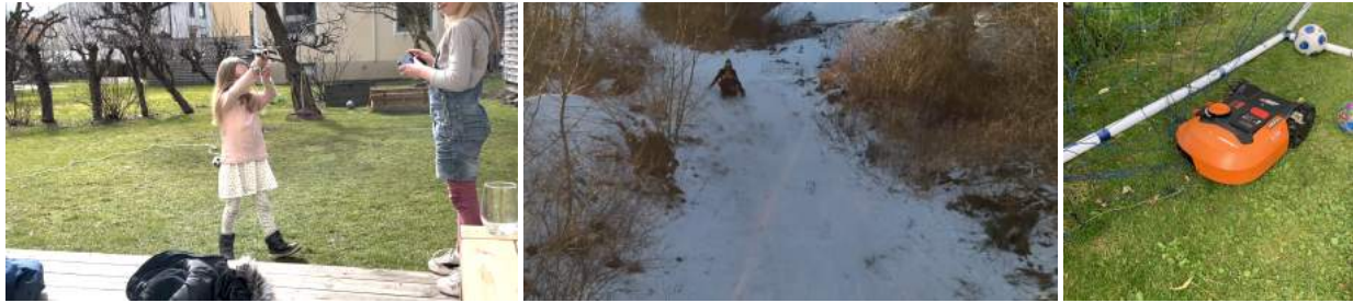
Figure 4: Three images showing (left) two 6 year old girls enacting the control and flight of a drone, (middle) a snow sled ride on a winter day, and (right) a lawn mower stuck on a net.