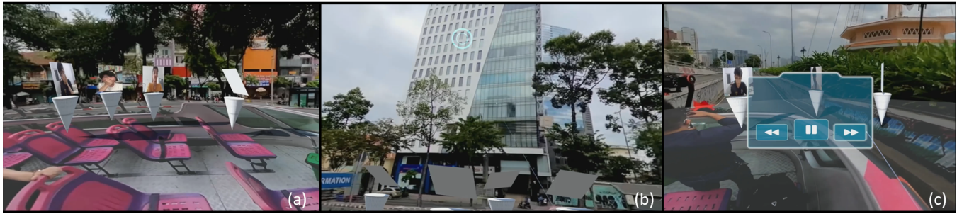
Figure 2: (a) Audience avatars in the 360 video skybox: the video stream showing the audiences’ behaviors and expressions and the avatar’s orientation conveying the audiences’ attention. (b) Holo marker pinned at a location to highlight a point of interest and audience avatars are looking at it. (c) The video control panel with 3 buttons: backward, pause, and forward

of their own face performing six expressions: neutral, concentrate, surprised, distracted, bored and laughing. These expressions were brainstormed and distilled by the research team based on the need-finding interview data. These recorded videos were displayed on audience avatars to create the impression there were audiences attending the tour guiding training session. To improve their realism, the audience avatars randomly moved around in the VR environment and some also turned towards the pointing location of the trainee user on the 360 video. Each participant had around 10 minutes to get familiar with the system. When they felt ready, they started the study where they performed a 10-minute tour guiding with a 360 travel video of the local city. The participants were given a sample script presenting about most interesting landmarks in the video 3 days prior to the study. The script was composed by the research team and the participants were told that they just needed to remember the main contents associated to certain times in the video, not word by word. To improve the sense of realism, the participants were told that some of the avatars in the VR environments were real audiences remotely joining into the session. After the tour guiding, the participants were interviewed for around 20 minutes to gather their feedback on the system.