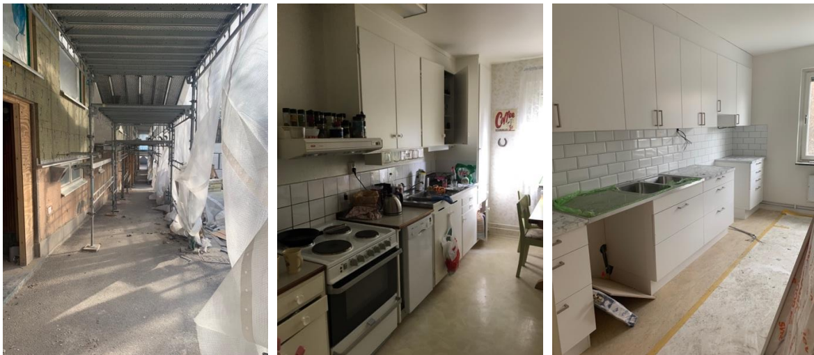
Figure 2a-c: Photos of Level 3 renovation, a) exterior and b) interior, kitchen pre renovation and c) during renovation.

Level 3 is a comprehensive or deep renovation with both external and internal measures. In this case tenants need to be evacuated for up to 12 months (Figure 2). The rents increase is high and so are the potential energy savings. One of the level 3 renovation where a new EPC has been carried out, reaches 74 kWh/m 2 and year after renovation which is a reduction of about 50% to pre-renovation levels.