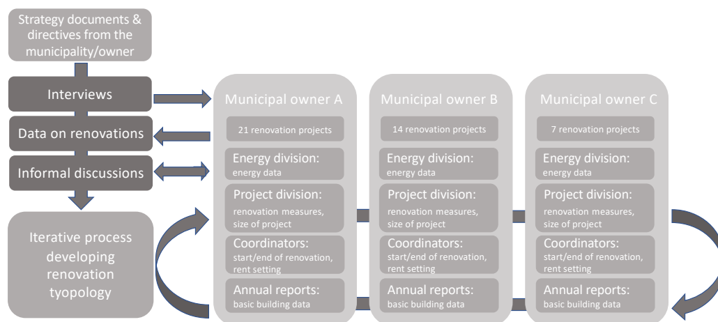
Figure 1: Schematic figure of the data sources and process for developing the renovation typology

In addition to the data retrieval, key employees at the housing companies (property managers, business managers and energy managers – depending on the internal sharing of responsibilities for renovation projects at each company) were interviewed on how they plan and organise renovation and energy efficiency projects. Due to the pandemic interviews were carried out digitally or over the phone, in some cases followed up by e-mail conversation. Finally, steering documents that describe owner's directives and political ambitions for the three municipal housing companies were studied.