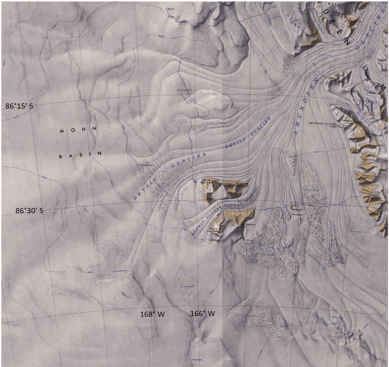
Figure 2. The Helge Massif. The figure was created by cropped sections from the maps USGS (1967a) and USGS (1967b).

In Figure 3 below, Amundsen's approximate route from the Butcher's Shop on 85°35' S to 87°07' S according to the analysis here is indicated by the green arrow, thereby illuminating the easterly drift created by the overestimated magnetic declination. The red arrow represents an assumed approximate route due south between the 168 th and the 169 th meridians. Figures 2 and 3 also display the "G chain" to the east of the Helge Massif.