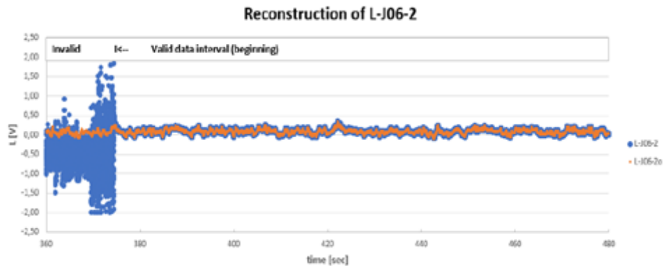
Figure 2: Example for the reconstruction (red) of a partially distorted SPND signal (dark blue). Results reproduced from [5]

the measurements at the correlated detectors (see Figure 2). The exact algorithm of signal reconstruction used in the CORTEX project was described in [17].