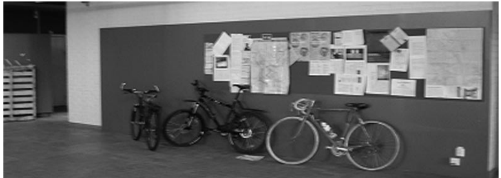
Figure 1 School info-board wall in its current state

on the bus stop with the info-board wall in the school building as an informative art piece, metaphorically presenting human 'extended senses'. Please note that position of the wall in the entrance area is visible from the working places of students;