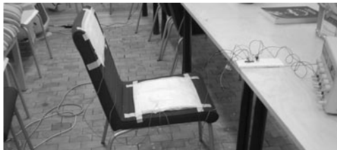
Figure 5 Chair equipped with pressure sensors