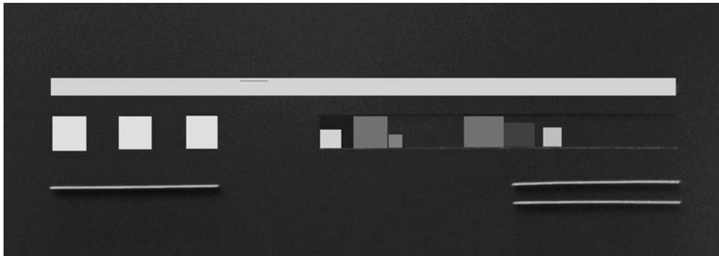
Figure 3 Design proposal for Info-board wall. Composition

The functional prototype consists of a constructed model of the wall in scale 1:10 (Figure 4) and a chair equipped with pressure sensors (Figure 5). The two sections of the prototype have been tested. The students showed special interest in the section 1 - the "traffic light" for catching the next bus to the city. The