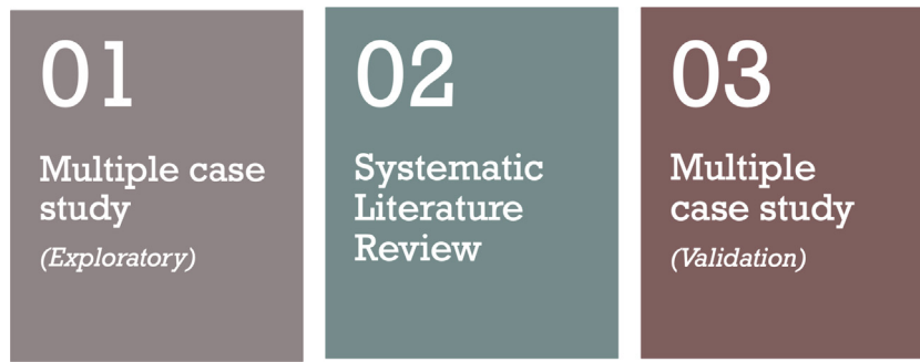
Fig. 1. Three-step Research Process.