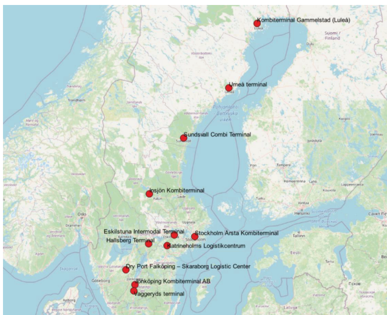
Figure 1. Dry ports in Sweden

Umeå terminal was initiated due to Bothnia Line – rail link connecting the north and the south of Sweden – which was introduced in 2010. The terminal is also connected to Stambanan that allows access to the entire railway network of Sweden. Most inbound goods are transported by train from terminals located in Göteborg, Malmö, Helsingborg and Nässjö. Umeå Combi terminal is established and owned by Trafikverket and then leased to Infrastruktur i Umeå AB (INAB). INAB in turn has hired Sandahls Goods & Parcel (a private company) to handle the daily operations. The main customers are Volvo, IKEA, Biltema and Carlsberg.