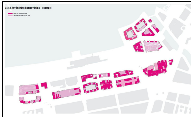
Figure 2. Site plan extracted from the Quality Programme exemplifying how public facilities and other functions (e.g., entrances) can be distributed over Masthuggskajen's ground floors (Göteborgs Stad, 2017b).

Leaving the empirical material aside for a moment, it can be argued that the creation of the Quality Programme involved yet another way of framing the qualities and values of Masthuggskajen's ground floors. One thing that distinguishes this mode of framing from that of previous activities is its diverging spatial focus on architectural design, aesthetic details, and programming of public spaces and facilities. Another thing that distinguishes it is the central role that architects and their visual representations played throughout the production of the Quality Programme. In fact, the site plans and renderings produced by architects functioned as value devices in a similar way to what the Sustainability Goals had previously done. In all this, value scales related to the aesthetic appearance (aesthetic value) and physical design (architectural value) played a more pronounced role than they had before, alongside scales having to do with attractiveness, economy, environment, cultural history, inclusion and social mix.