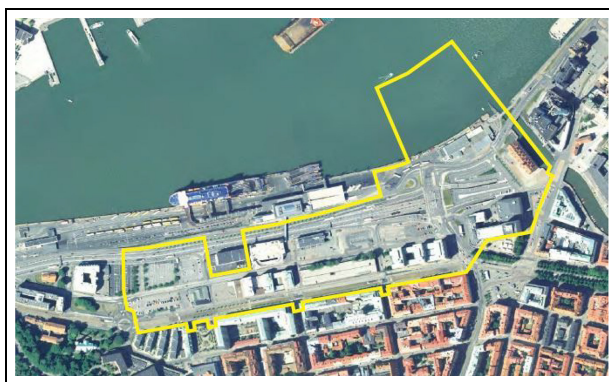
Figure 1. Masthuggskajen pre-development. The approximate area subjected to development can be seen within the markings (Göteborgs Stad, 2017b). Directly to the south one can discern the area of Linnéstaden with its popular Långgatorna quarters.

With the help of the theoretical framework, this section will provide a chronological exposé of how the values and qualities of Masthuggskajen's existing and future ground floors were framed over 10 years of redevelopment. The analysis will specifically focus on inter-organisational activities, as