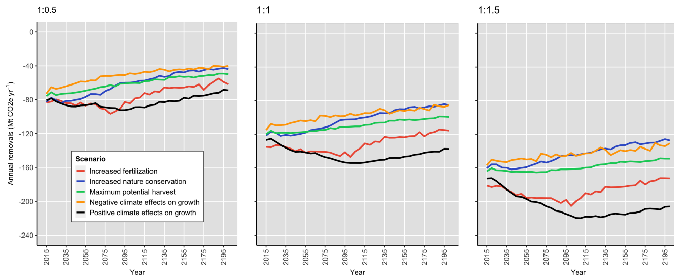
FIGURE 2 Total annual estimated net carbon sequestration and substitution, selected scenarios (2015–2195). The scenarios include changes in all carbon pools (see Table 2) and substitution for three different assumed substitution effects (0.5, 1 and 1.5 tonne CO 2 e per m 3 stem wood)