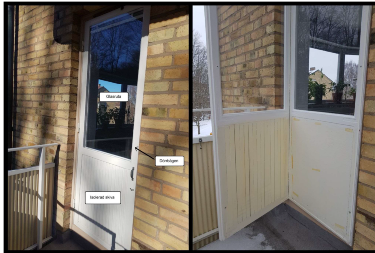
Fig. 1. The balcony door with the upper glazed part and the lower opaque part, insulated with a 12 mm wooden board.

The housing area consist of 196 apartments in several three-story buildings. The area was constructed by a private housing cooperative in 1948-1950. During the last years, infrared thermography has been used to identify thermal bridges in the buildings. One of the major thermal bridges consist of the opaque part of the balcony doors, see Fig. 1. This part can become very cold during wintertime and create a cold surface on the inside that has led to complaints on insufficient thermal comfort from the members of the housing cooperative. To improve the situation with the insufficient thermal comfort and decrease the energy use in the buildings, one of the proposed measures is to install insulation in the opaque part of the balcony door. Due to the limited space available it is possible to install only 10 mm insulation.