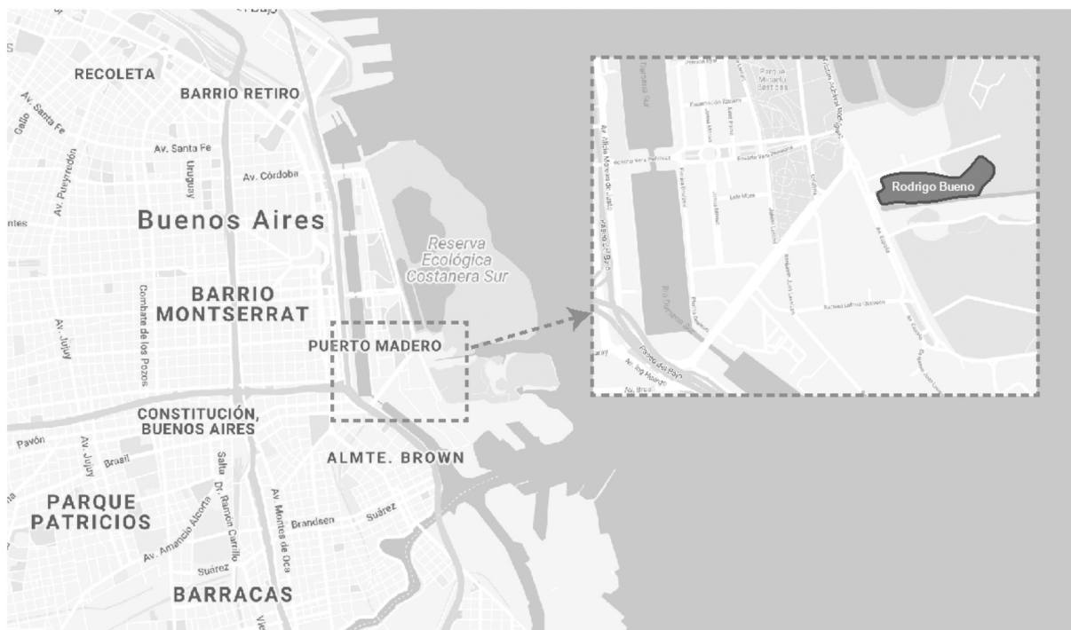
Map 1. Villa Rodrigo Bueno and its context. Google Map data ©2019.