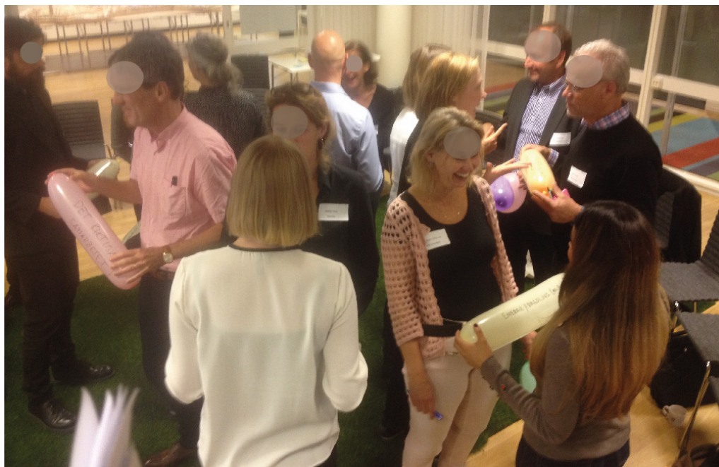
Figure 3. Example of ‘play’ as a meeting characteristic (case no. 2) that was created to engage emotions and open spontaneous communication beyond the rational. This example shows a playful format with balloons in the form of speed dating.

Physical characteristics relate to the meeting settings and environments (e.g., appropriate venue quality, provision of refreshments) and the characteristics of the attendees. The seating and a nice room were the main characteristics identified under physical characteristics. Appropriate venue quality and provision of refreshments were mentioned in the literature; however, less was said about physical characteristics that can enable different seating arrangements or movement. Under this category, a new characteristic was used: half-moon seating. Furthermore, Table 2 shows that all physical characteristics were difficult to achieve in the digital cases. Figure 3 illustrates an exercise that captured several of the characteristics that were challenging to achieve in a digital format, such as sharing a nice room (spacious, good air quality, flexible furniture), (2) flexible seating, such as a round table or half-moon seating, (3) movement of the body across the room to engage physically, and (4) dialogue/coaching in pairs.