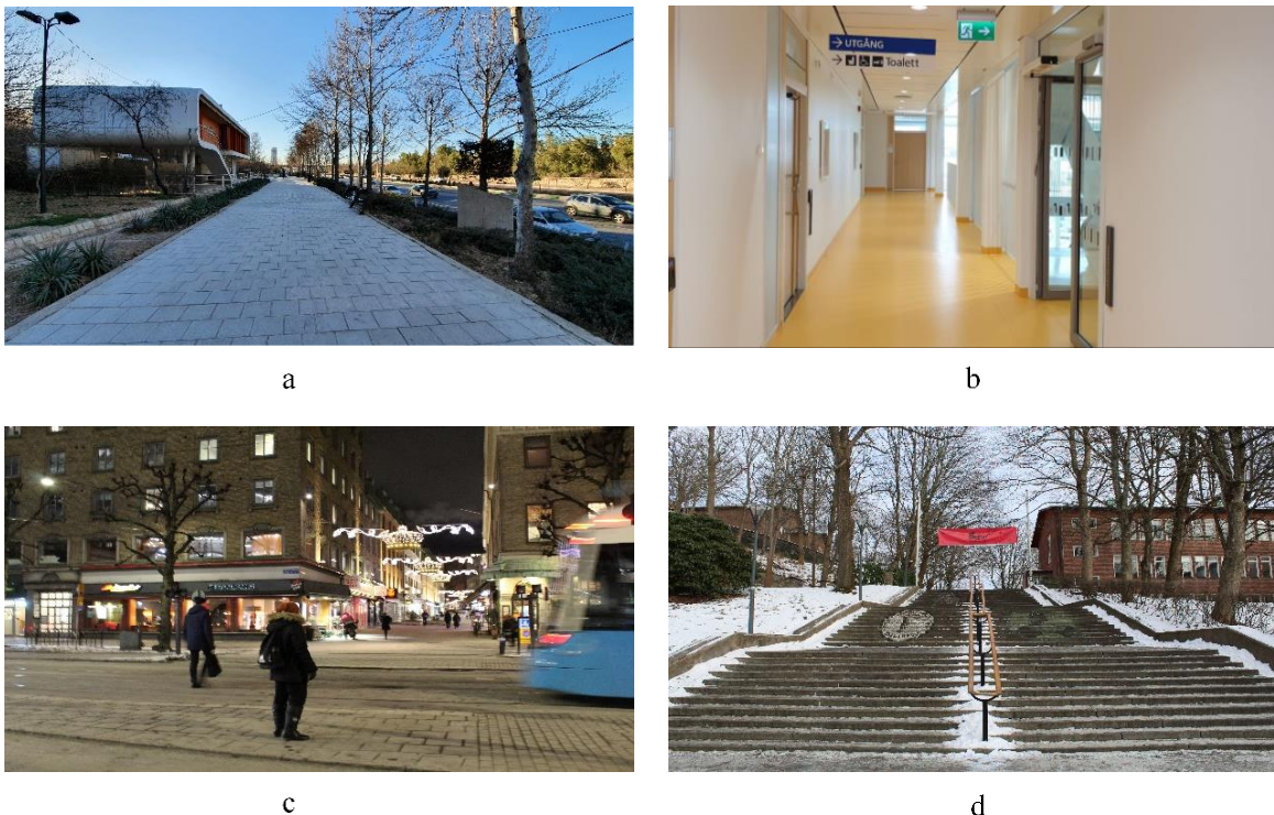
Figure 3. Examples of real-world environments (a and b) and real-world + environments (c and d).

Physical environments are also defined in the safety protocol. The test bench is where the prosthesis can be mounted and tested, disconnected from the participant. The mounting and placement of the prosthesis should be done in a manner by which the safety of the research staff is ensured, preferably inside a cage or in an otherwise shielded-off environment. Laboratory environments include ambulation on a treadmill or in a small circuit in a clinical laboratory room, with minimal distractions and even surfaces. Outside lab environments are separated into “real-world” and “real-world +” environments where the latter is defined as environments which are challenging to navigate with a lower limb prosthesis, for example due to uneven terrain, slippery surfaces, or crowds. Examples of real-world and real-world + environments are shown in Fig. 3.