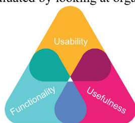
Fig. 4. Elements analyzed for method or framework success

Measurement of a method/framework success is an important element of the approach followed in this review, given that they are typically refined until stable and further tested in wider environments [59]. Method/framework success was judged in response to a set of criteria: usability, usefulness, and functionality, see Figure 4. Usability indicates whether the process was easy to implement. Functionality describes whether the process does what it was designed to do. Usefulness was evaluated by looking at organizational impact.