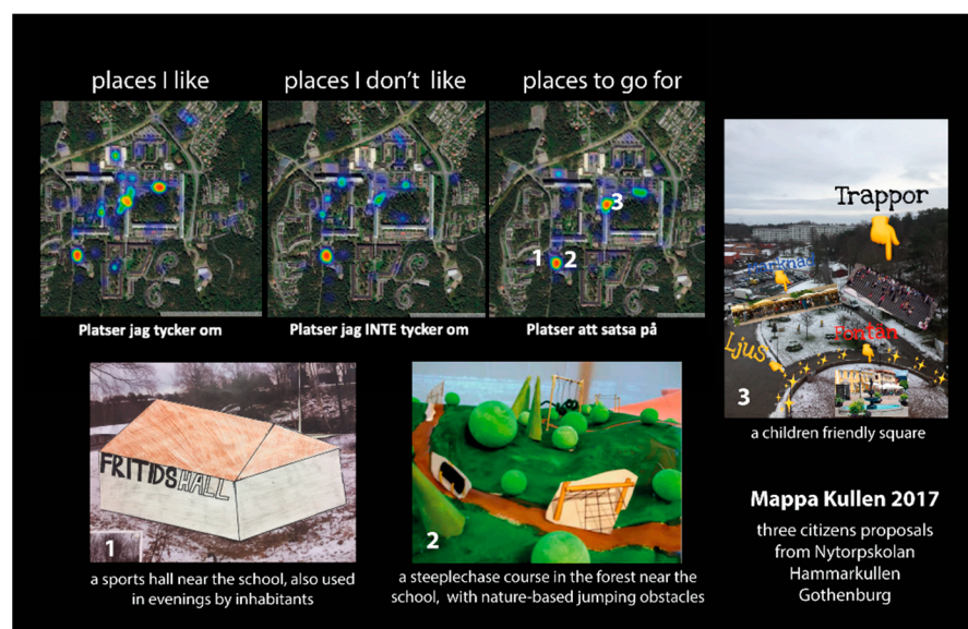
Figure 2. The results of pupil's choice.

Based on that information, the pupils were tasked with proposing something for a place about which many opinions were given. They went to the three sites selected by most people, documented them with photos, and discussed them. In collaboration with their art teacher, they then designed something that would solve the problems noted, but without destroying the positive qualities mentioned about the same place. Thus, they worked in an interdisciplinary manner, involving several core subject teachers. The results were design proposals for: (1) a sports hall near the school, also used in evenings by inhabitants; (2) a steeplechase course in the forest near the school, with nature-based jumping obstacles; and (3) a child-friendly square (See Figure 2).