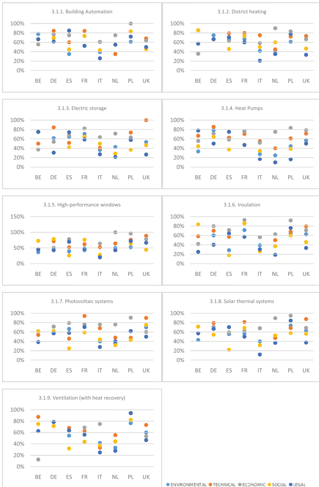
Figs. 3.1.1–3.1.9. The percentage of respondents choosing a driver group across the selected EETs and countries.