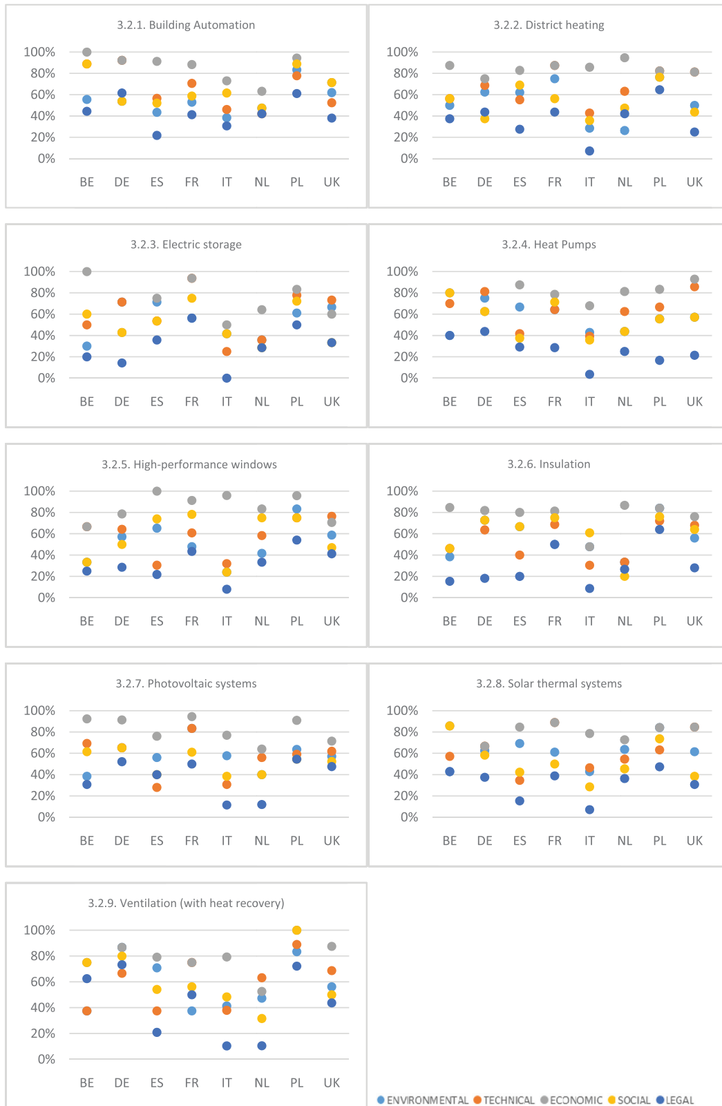
Figs. 3.2.1–3.2.9. The percentage of respondents choosing a barrier group across the selected EETs and countries.