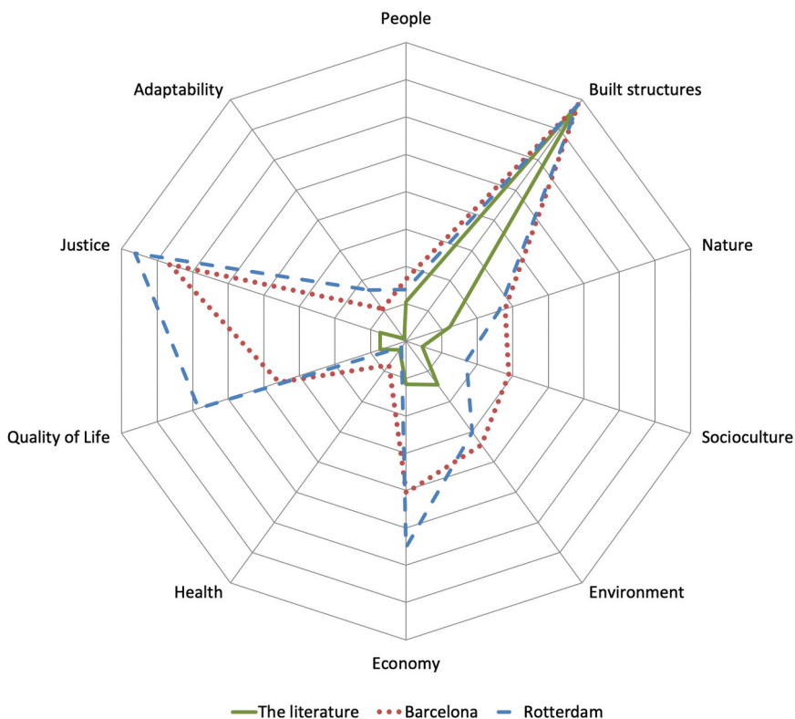
Figure 1. A comparison between number of occurrences of compact city qualities in the literature and stakeholder interviews in Barcelona and Rotterdam. The theme 'Built structures' is set as a common scale reference to facilitate comparison.

The two-tier analysis also made it possible to compare academic and stakeholder discourses on compact city qualities (see Figure 1). A first observation is that neither the literature nor the stakeholders discuss 'People' much as an important theme of compact cities, but presumably an increased density, diversity and proximity of people is seen as a self-evident outcome of a higher intensity of 'Built structures', such as housing and workplaces. Also, compared to the literature, the stakeholders seem to emphasize 'Nature' much more.