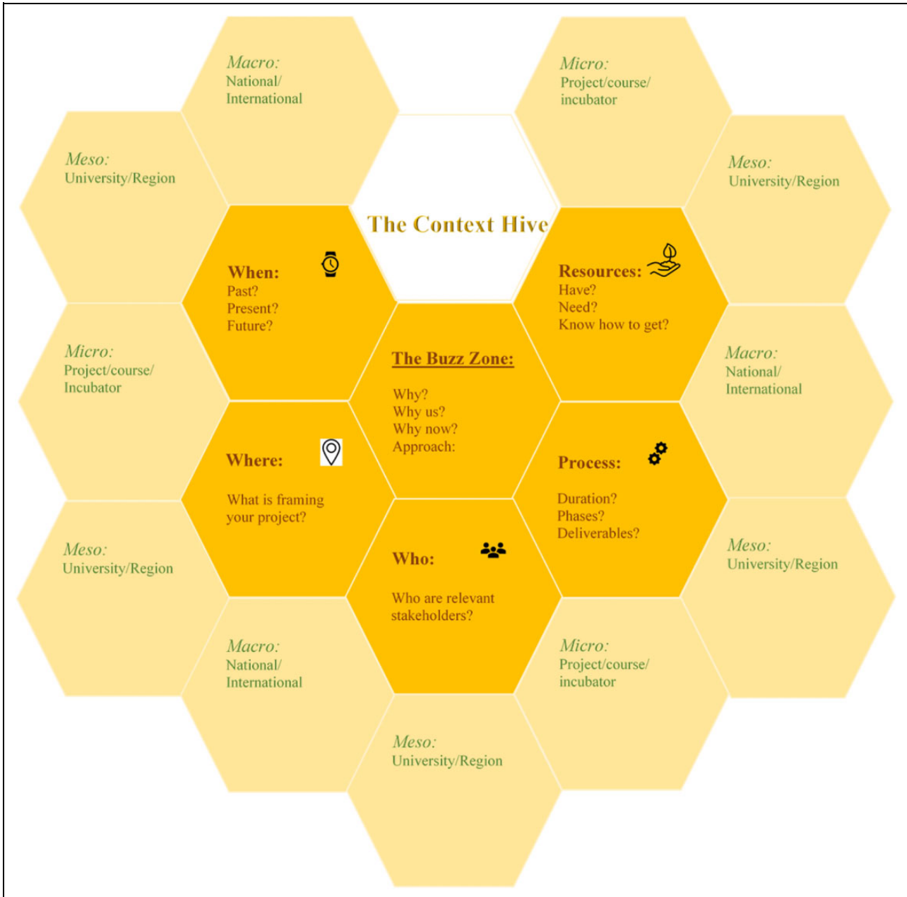
Figure 1. Hexagonal learning structure for context mapping.

hexagonal learning structure (see Figure 1); (ii) Buzz Cards (see Figure 2); and (iii) an action chart (see Appendix 1). These are presented in detail in the following sections.