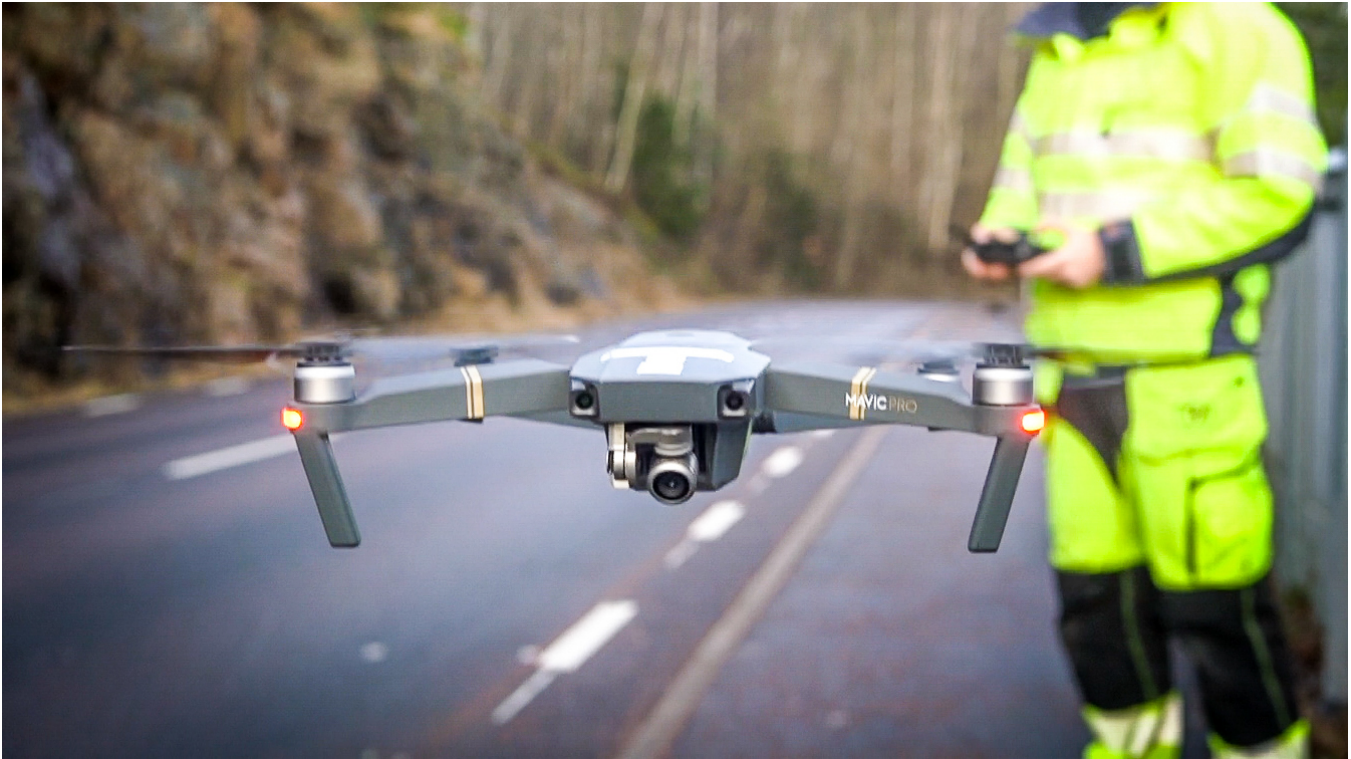
Figure 1: Drones are becoming integrated in work practices.

details of piloting procedures or how safety measures and liability protection are implemented in studies with co-located drones.