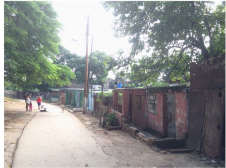
Isla De Polvo