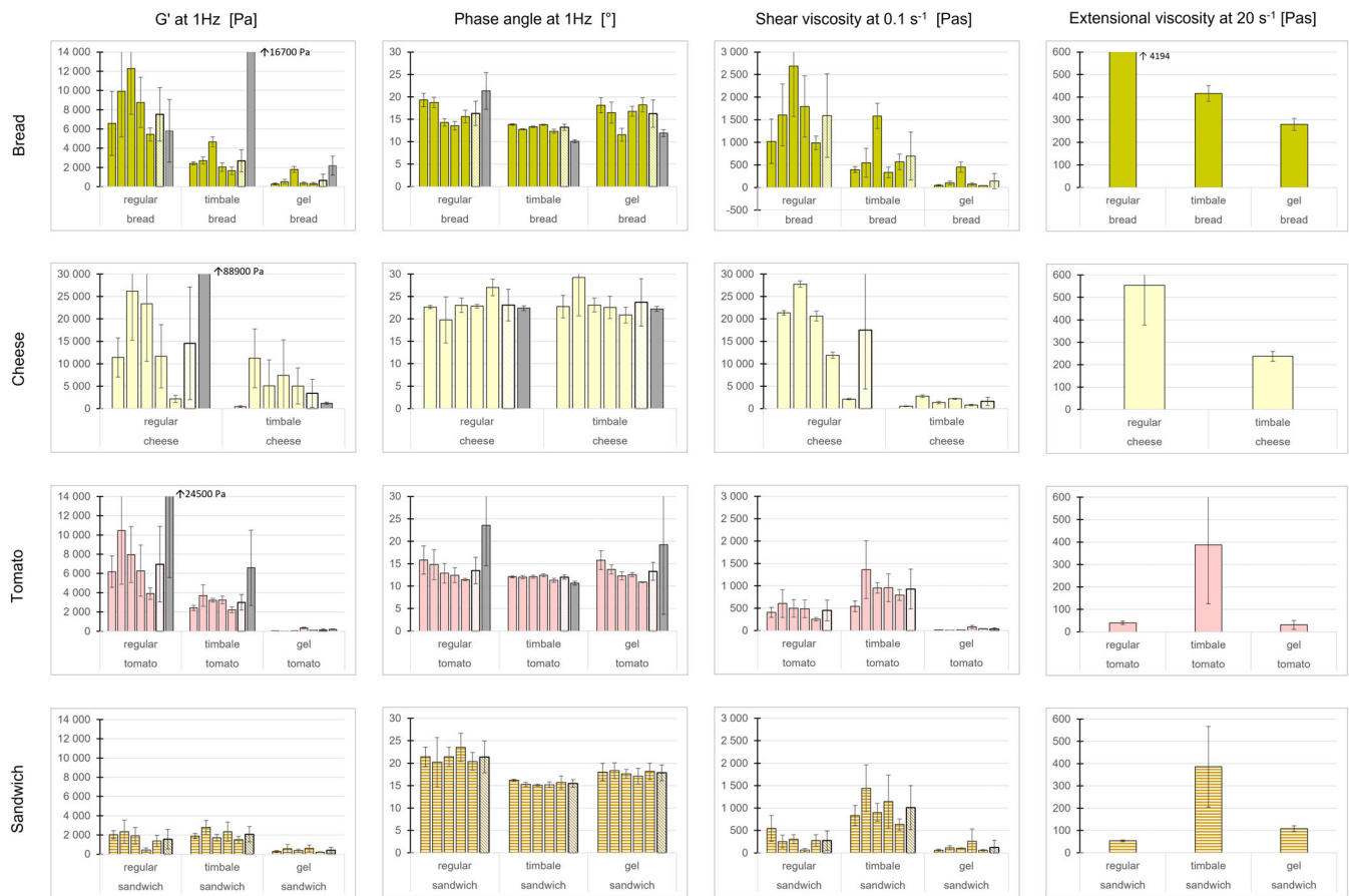
FIGURE 5 Rheological properties of the boluses for the five subjects in shear. Each group shows bars ranging from subject one to subject five from left to right. Averages over all subjects are presented with diagonally striped bars. Where comparable data exists for the food products, these are presented as gray bars

Figure 5 shows bolus rheology for all subjects and foods. Viscosity and modulus decrease with modification level, regular > timbale > gel for bread and cheese but not for all parameters for tomato and sandwich. As mentioned previously, the phase angle has little variation with level of modification and more reflects character of the fluid that a bolus is. G' for tomato follows the modification level as it reflects the bolus structure rather than its flow properties. Shear and extensional viscosity on the other hand reflects the flow resistance and the dispersion of crushed tomato cells in regular tomato therefore have low viscosities.