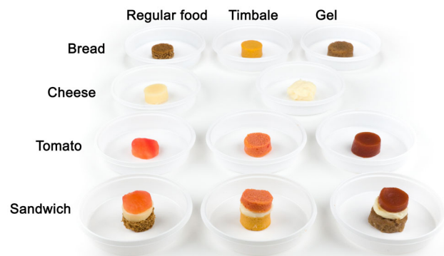
FIGURE 1 Model foods used in the study. Note that processed cheese spread is used for both timbale and gel diets, and that the figure shows food appearance and texture and does not reflect the size served nor the exact composition of the sandwiches

The general and oral physiological state was determined for the five subjects by a set of established tests (Kito et al., 2019). The tests for general status included hand strength and one-legged standing. The oral physiological state was characterized by both tongue strength and oral diadochokinesis tests. Table 1 shows the results that demonstrate that all subjects were healthy, fit and had good oral strength. The main objectives of determining the physiological status was to prepare for future comparisons with senior subjects and to conclude that the group of subjects can be classified as healthy.