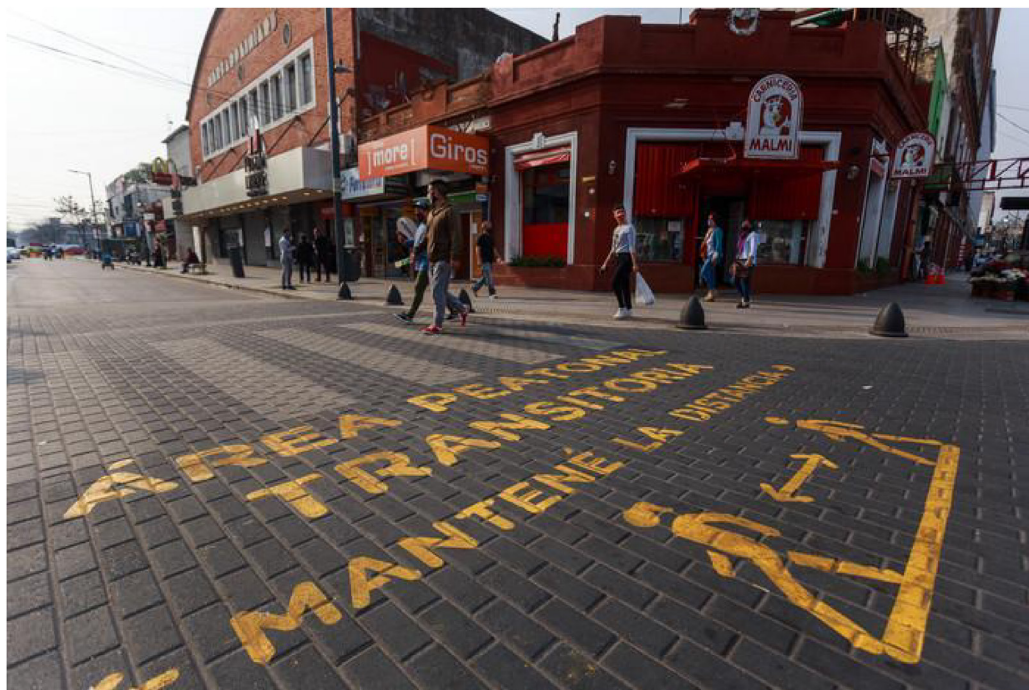
Figure 7: Social distancing instructions on roadway, Buenos Aires.