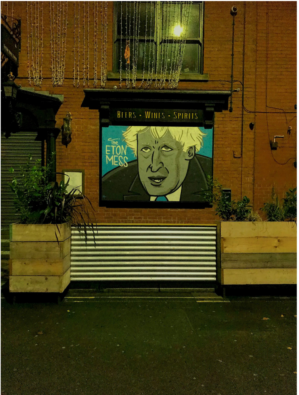
Figure 3: Photo of street art in Manchester, England, depicting Prime Boris Johnson which reads 'The Eton Mess', a reference to Boris Johnson's private school education in Eton, in the context of perceptions of a London-centric approach to pandemic management and conflicts between leaders of several northern cities and the UK Government over the terms of localised restrictions.

The last ten years have also been described as an era of 'super austerity' (Lowndes and Gardner 2016), with significant reductions in public funding since 2010. Prior to COVID-19, the UK2070 Commission (Home The UK2070