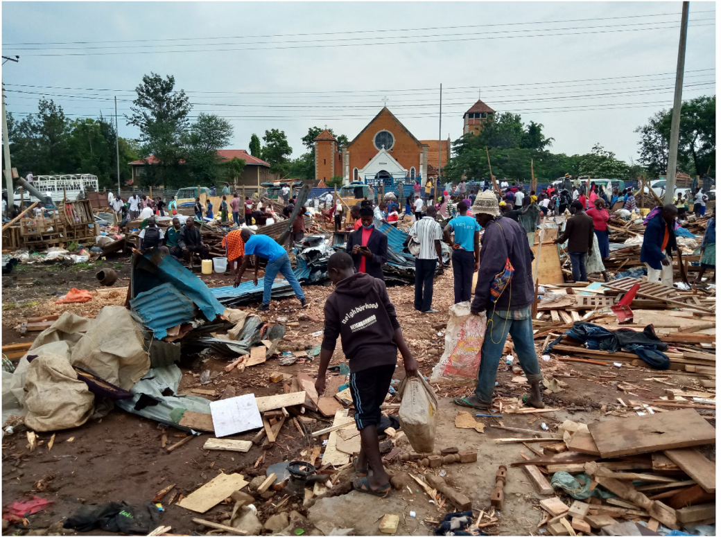
Figure 4: Demolition of the Kibuye market in Kisumu during the COVID-19 lockdown period. Traders did not get an opportunity to salvage their goods because demolition occurred during the night-time curfew. As often in such circumstances, demolition was justified on public health grounds, with construction of a new formal market planned, but with scant regard for the assets and livelihoods of the affected traders.

to raise and manage funds for mitigating the adverse effects of the Coronavirus and floods, in a bid to promote socio-economic recovery in the whole county.