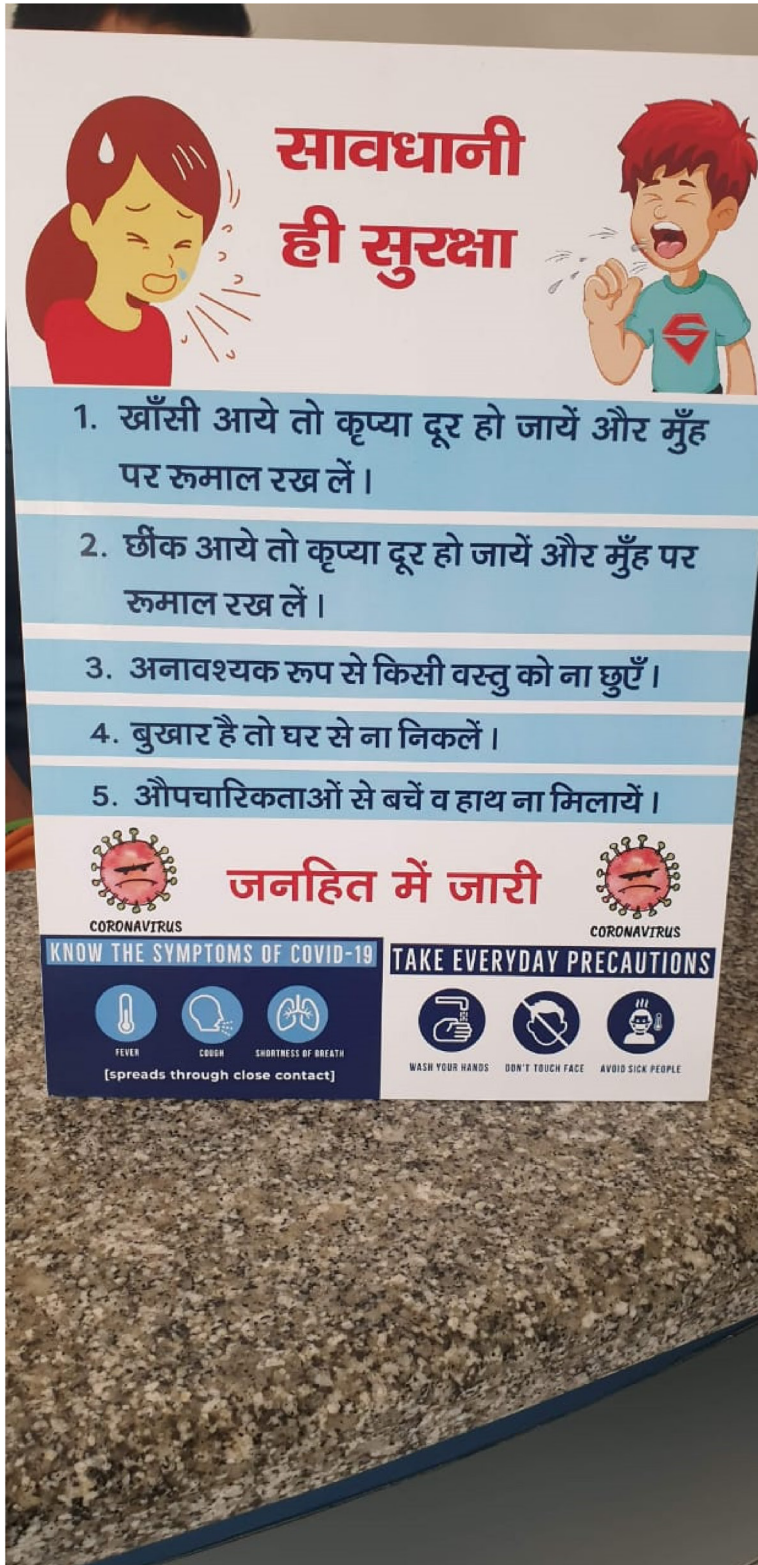
Figure 6: A poster in Dehradun explaining health precautions against COVID-19 in Hindi, expressed as dos and don'ts.