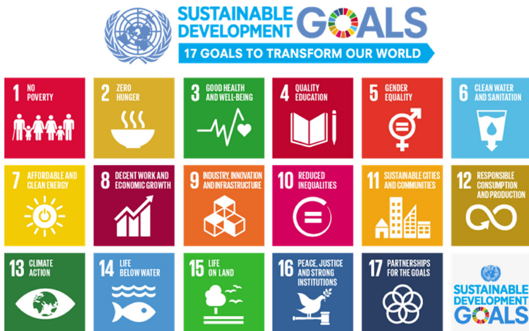
Figure 1: The 17 SDGs adopted in 2015 as part of Agenda 2030.

to and engaged with the 2015–16 global sustainable development agenda, comprising especially Sustainable Development Goal (SDG) 11 and the New Urban Agenda (NUA). These comprise the specifically urban components of the global agenda, providing aspirational commitments, goals, targets and indicators to promote urban sustainability with equity – expressed as ‘leaving no-one behind’. Responses from the cities were diverse, ranging from low engagement because of a lack of guidance from national government and because existing local indicators were deemed adequate (Sheffield) to enthusiasm to enhance engagement with national government and in order to align activities and reporting to global indicators (Cape Town) and a valuable opportunity to update, rethink and systematise service delivery and public investment priorities (Kisumu) (Simon et al. 2016; Valencia et al. 2019, 2020).