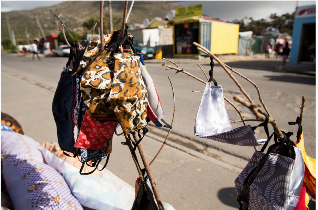
Figure 5: Face masks on sticks for sale by the side of the road in Masiphumelele informal settlement, Cape Town. Wearing face masks in public is compulsory in South Africa; failure to do so can be punishable by imprisonment of up to six months.

saw the highest number of infections also have high urbanisation levels. Even in states with lower urbanisation levels, the spread was restricted to their major cities. Some estimates even suggested that 70% of all cases were recorded in just thirteen Indian cities (Kurian 2020). The recent insights from the fields of consumer-centric research also highlights the fact that rural India is likely to recover faster from the pandemic than the urban areas ( Financial Express 2020).