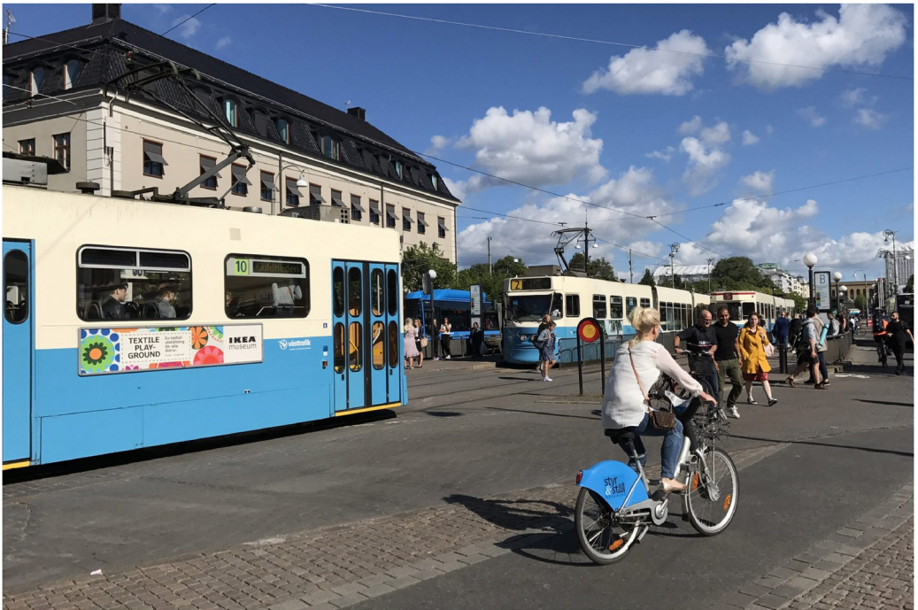
Figure 2: Temporary bike-lanes, free rental-bikes, more pedestrian space and significantly reduced parking fees were some of the measures taken by the City of Gothenburg to promote other means of commuting than crowded public trams and buses.

temporary market stalls or outdoor cafés and restaurants were reduced to zero, to support local businesses (Figure 2).