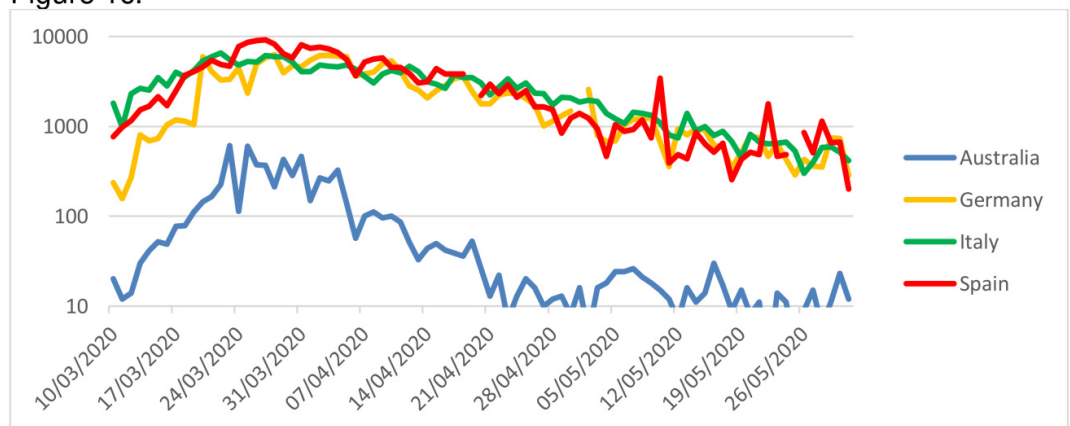
Figure 1. Logarithmic scale visualisation of daily new confirmed COVID-19 cases from 10/03/2020 to 31/05/2020. Figure 1a: India, Kenya, Mexico, and South Africa. Figure 1b: Canada, Sweden, and the U.K. Figure 1c: Australia, Germany, Italy, and Spain. (Source of data: Our World in Data).

Q2: Who are the COVID-19 science communicators? (agenda setting)