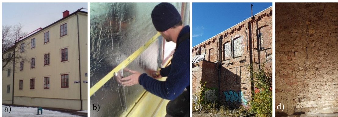
Figure 1. Installation of insulation on the interior or exterior of listed buildings. a) Multi-family building from 1930s in Gothenburg [12], b) Installation of VIPs on the exterior, c) Industrial building from 1896 in the south of Gothenburg, d) Sensors inside the case study building.

Generally, façades can be insulated either on the interior or exterior side, see Figure 1. Interior insulation can be used in buildings where the exterior characteristics of buildings may not be altered due to cultural heritage protection. This is common for many buildings in Sweden from the period before 1940. Energy efficiency, thermal comfort and building performance are all affected by an interior insulation. Earlier research has shown that interior insulation decreases the drying-out capacity in the outer wall and increases the risk for freeze-thaw damages in brick walls [10]. Interior insulation will also negatively affect the thermal storage capacity of the building and change the interior appearance of the walls. This is particularly important to consider for historical and/or listed buildings [11].