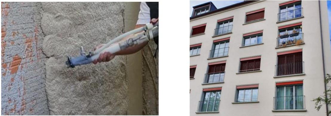
Figure 1. Left: SIP applied by a spray machine on a demo-wall. Right: SIP applied on the exterior façade of a residential building in Zürich, Switzerland.

SIPs are new types of energy-efficient plasters mixed with aerogel particles [4]. Aerogels are highly porous and ultralight SIMs with thermal conductivities as low as 0.013 \text{ W}/(\text{m}\cdot\text{K}) at room temperature [5]. SIPs with thermal conductivities of approximately 0.028 \text{ W}/(\text{m}\cdot\text{K}) at 23^\circ \text{C} and 50% RH, compared to values of approximately 0.6 \text{ W}/(\text{m}\cdot\text{K}) for conventional plasters, have been commercially available since 2013 [4, 6]. The plasters contain up to 90% hydrophobized silica aerogel and often a lime-based binder. As for conventional plastering systems, spray machines to apply the plaster on walls can be used also for super insulation plasters, see Figure 1.