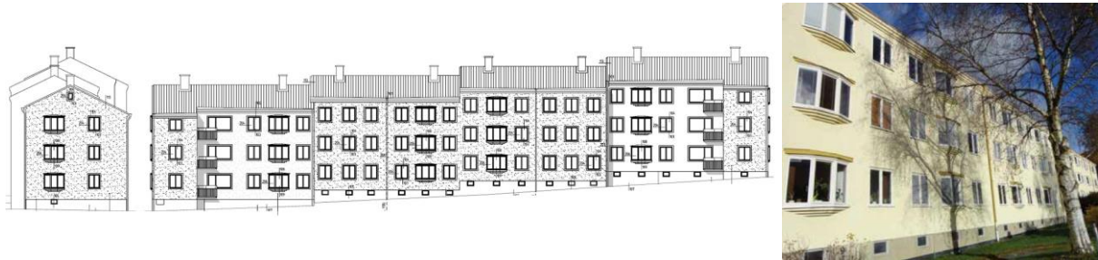
Figure 2. Left: drawing of the exterior façade of the reference building facing south and the gable facing west. Adapted from original drawings made by 'arkitetbyrå AB' [8]. Right: Photo of one of the buildings in Torpa. Adapted from [7].

Figure 2 shows the exterior of the reference building. The approximate dimensions of different parts of the building are measured from the available drawings and are presented in Table 1. The building is ventilated by natural ventilation and district heating is used for the heating system. The indoor temperature is set to 21 °C.