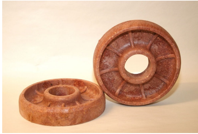
FIGURE 1 Products in the case study—core plugs for the paper mill industry

should be prioritized to develop countermeasures only if they correspond to cause factors; they may cause other failure modes with large impacts on circularity even if their direct impacts on circularity are small.